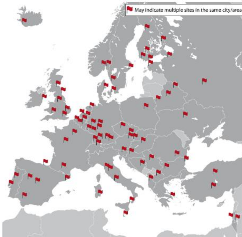
Figure 2: Clinical trial network of EU-AIMS