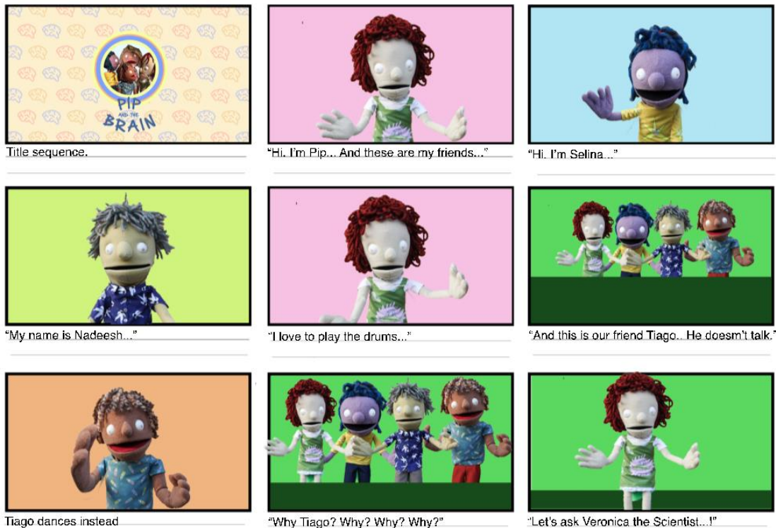
Figure 3. Storyboard (first page) of Pip and the Brain Explorers

Videos: KCL has produced a video that explains to families what study participation involves, created a facebook page for families SynaG: www.facebook.com/euaimssynag | Facebook LEAP: www.facebook.com/euaims , and created a puppet movie (Pip and the Brain Explorers) which shows families and young children what an MRI scan involves (see figure 4).